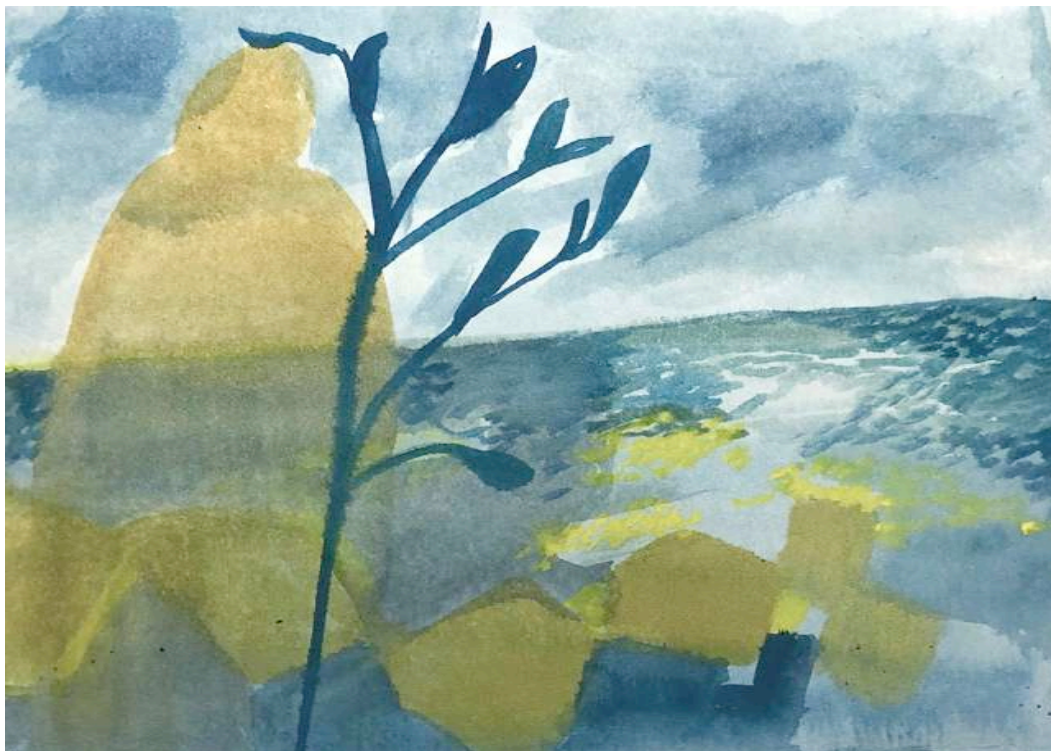
Carried Through Time , 2021