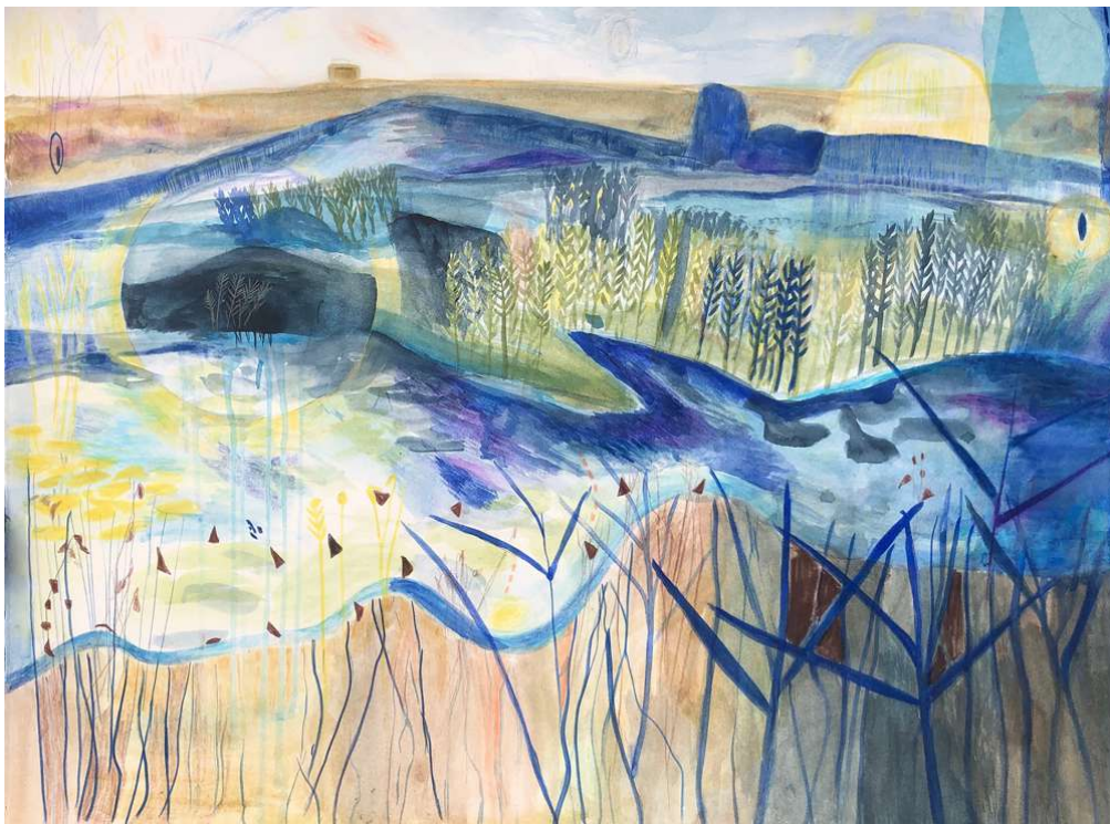
Letting Light In, 2021