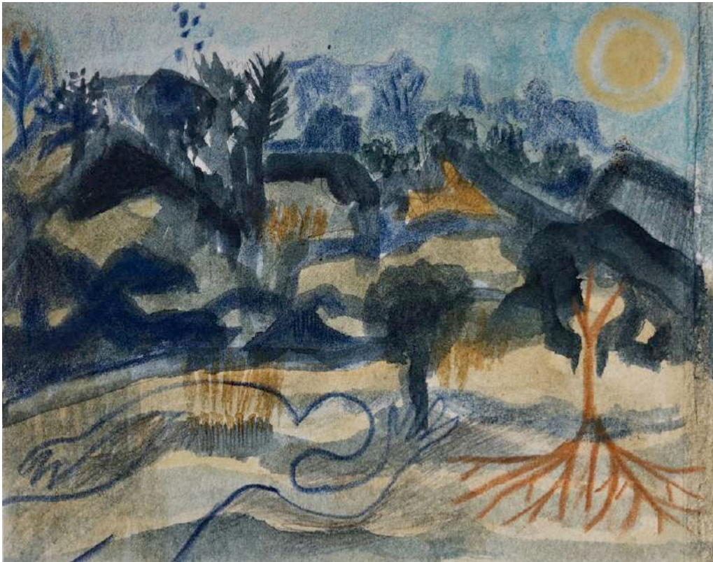
Swimming in Sand 2021. Watercolour and pencil on paper. H180mm W210mm

‘As I walk in this landscape throughout the year, I sense the shifting light and temperature, the way the natural world and the plants respond to each change in the atmosphere. As I stand by the ponds I sense a wide and beautiful universe that is there as soon as we are quiet enough to see it and sense it. The way the light hits the rippling water, the seagulls swoop above; the swans go about their business, the rushes and reeds create a symphony of sound with the wind. I am made aware that ‘real life’ is so much more interesting than the noisy news given to us on screens and the fear that we are being encouraged to feel as often as possible.