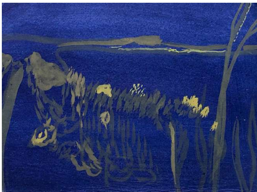
Night Beams IV , 2021