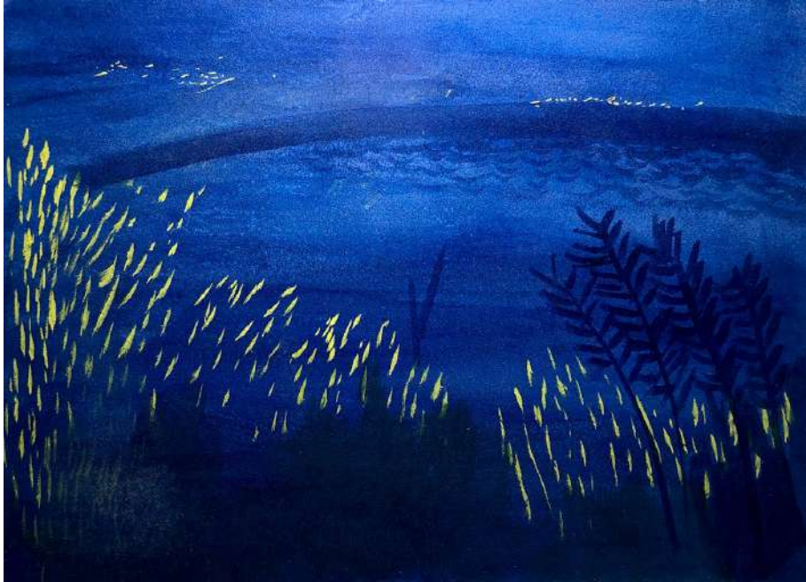
Night Beams III, 2021

Watercolour and gouache on paper H220mm W270mm £225