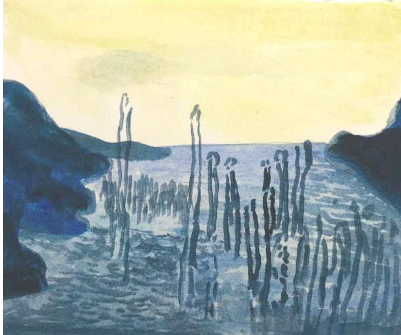
Echoes of Silence , 2021