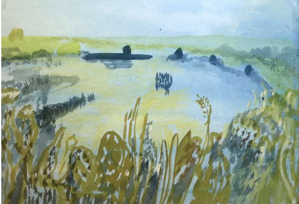
At the Ponds, 2021

Watercolour and gouache on paper H210mm W260mm £225