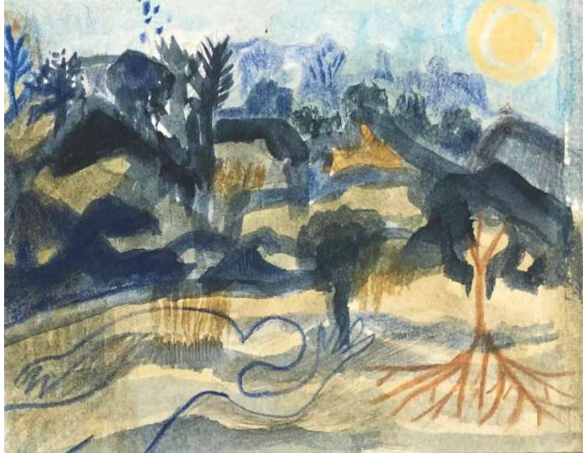
Swimming in Sand , 2021