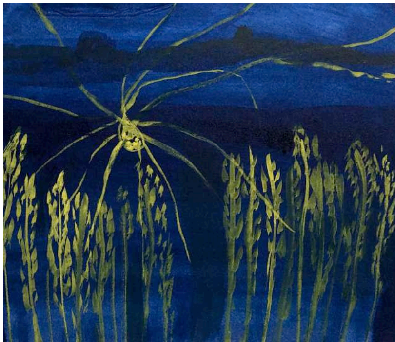
Night Beams II, 2021