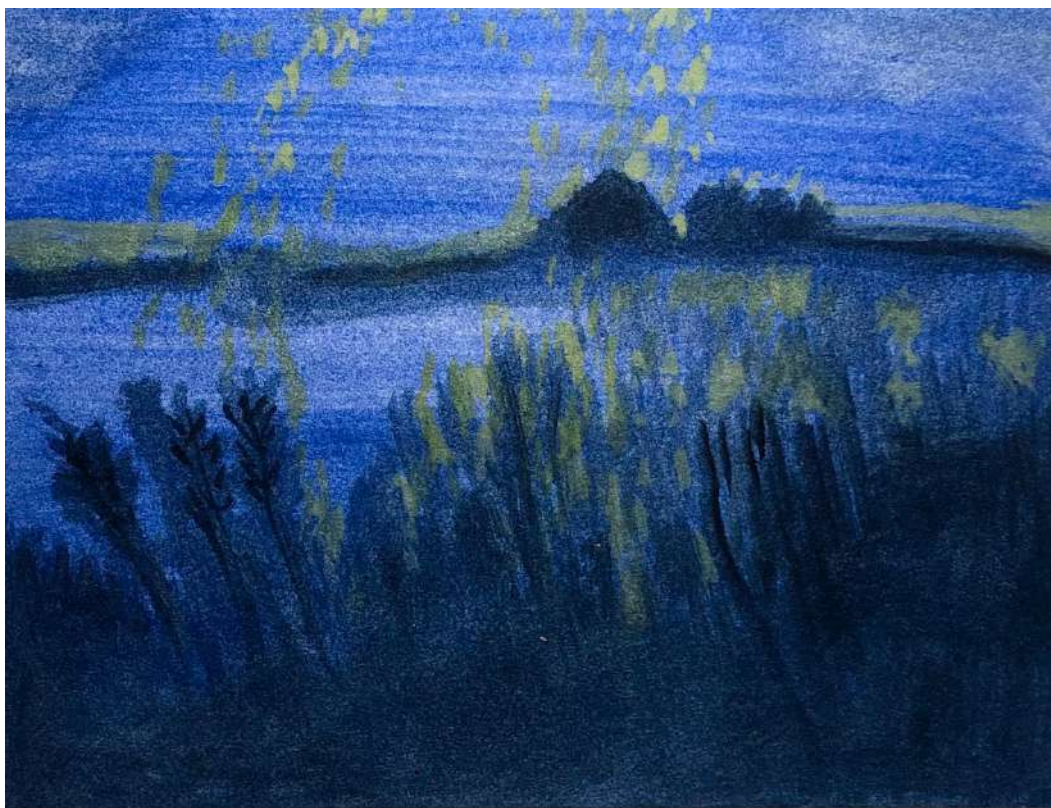
Night Beams I, 2021

Watercolour and gouache on paper H180mm W210mm £145