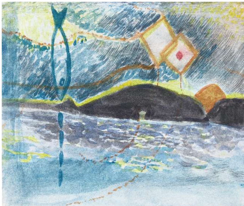
Caught in the Ether, 2021

Watercolour and pencil on paper H210mm W230mm £185