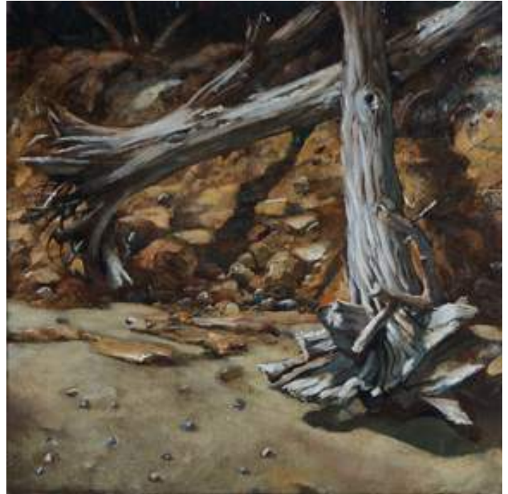
House at Easton Bavents + Dead Trees on Beach, 2020.