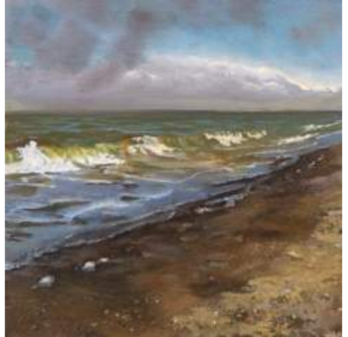
Concrete Sea Defences Happisburgh + Beach at Dunwich, 2020.