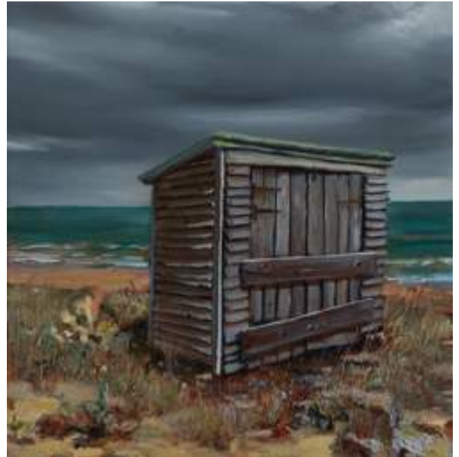
Ruined Pillbox and Bladderwrack + Hemsby Shed, 2020.