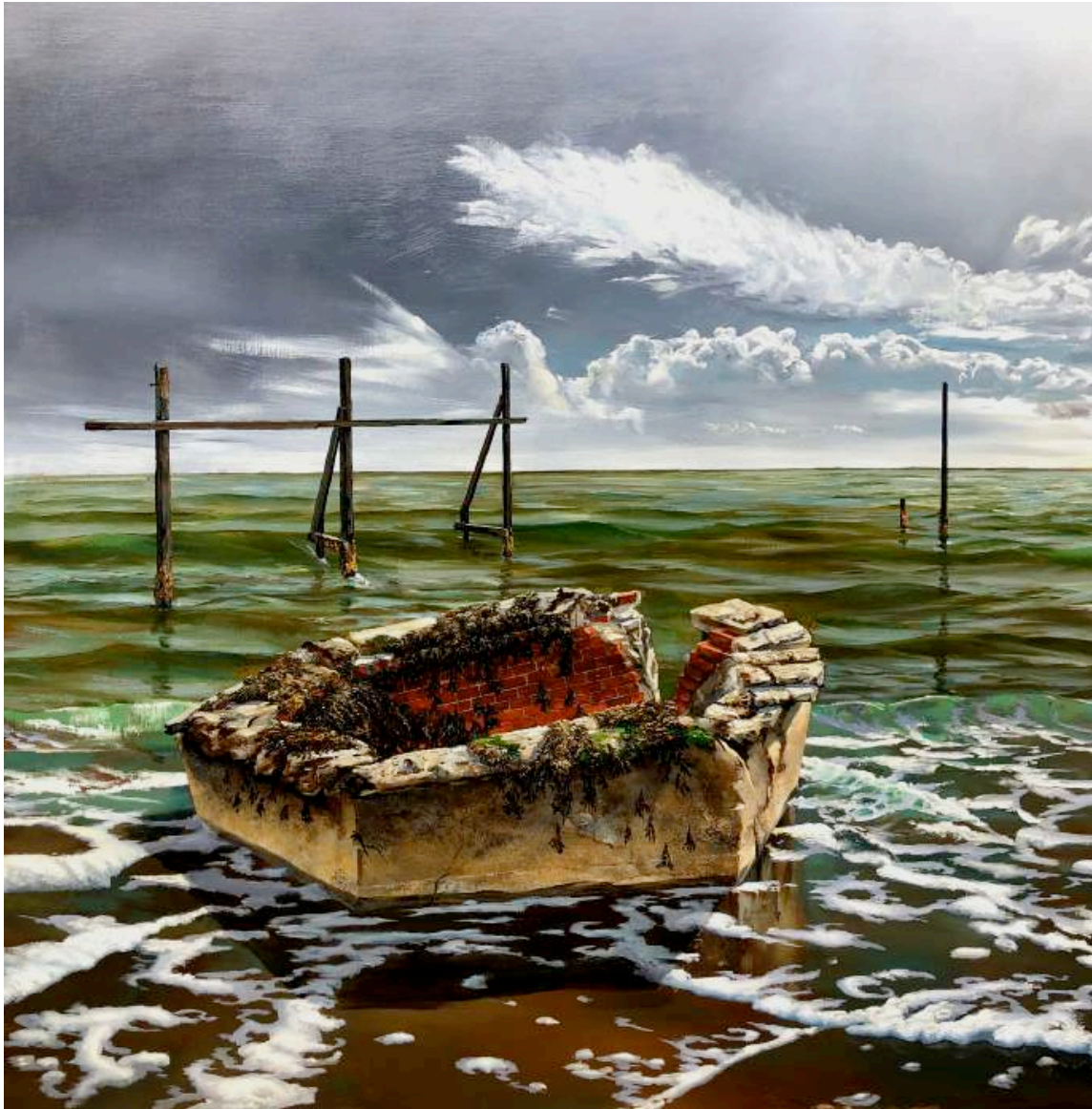
Pill Box and Incoming Tide, 2021 Oil on panel. H1220mm W1220mm. £16,000