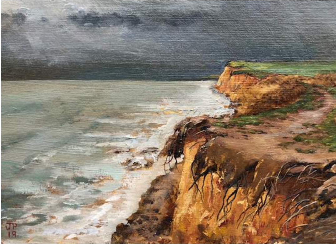
Footpath at Covehithe, 2019.