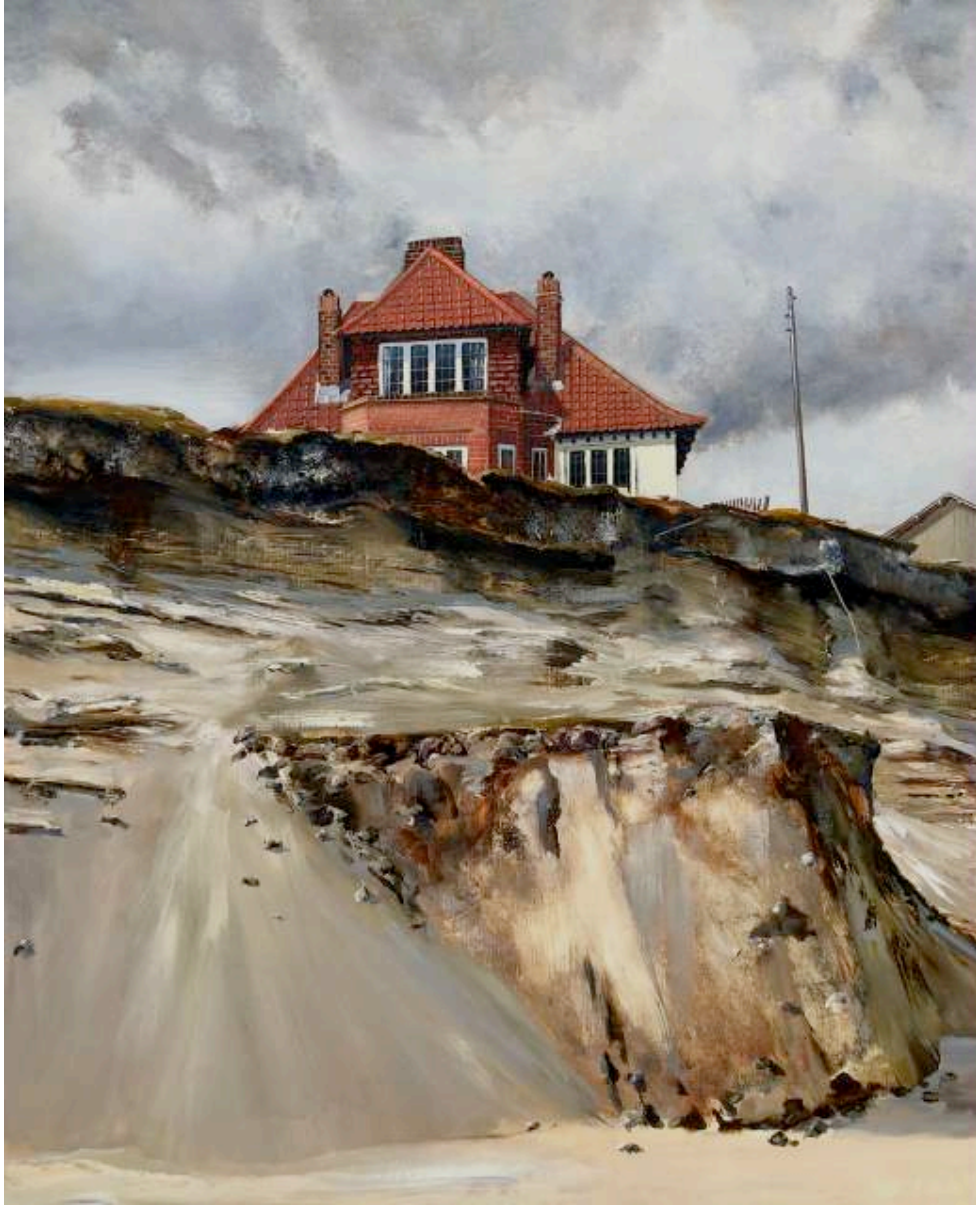
Suffolk Cliffs , 2010.